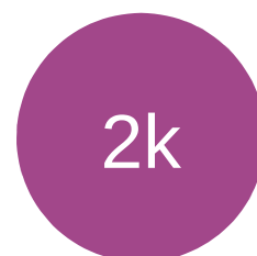
Implementations per day